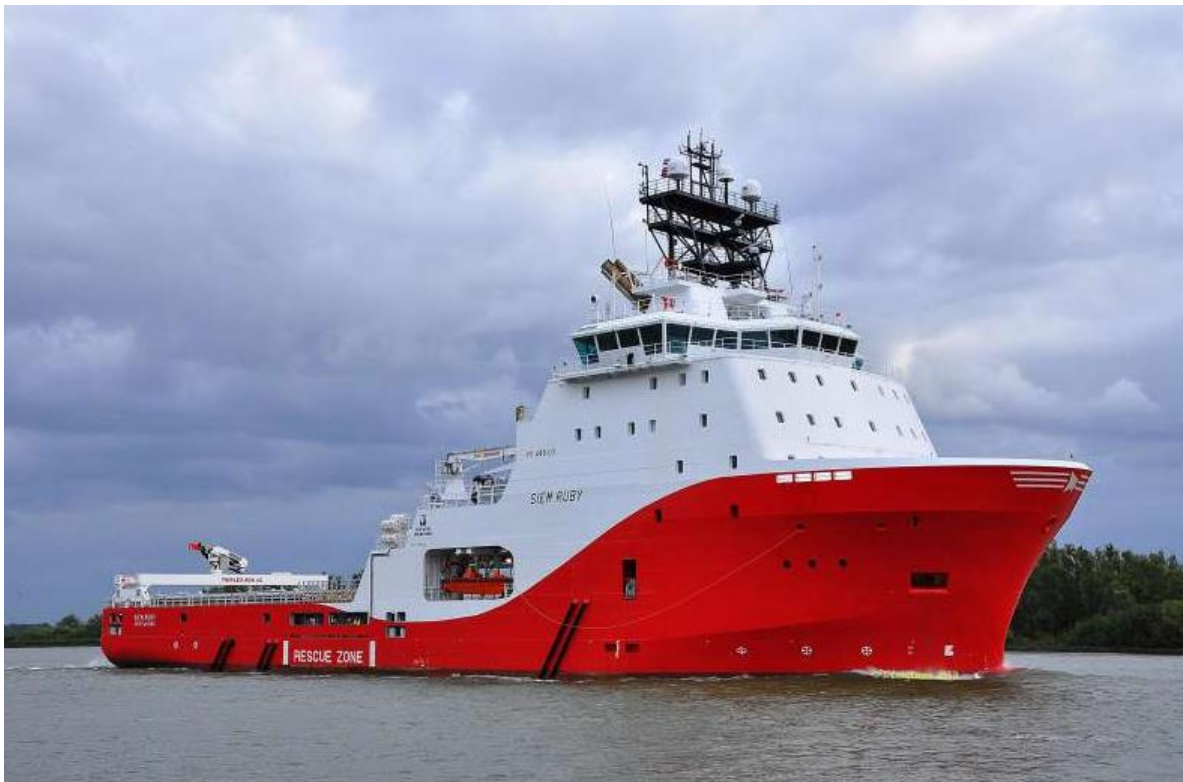
SIEM Offshore "Ruby"