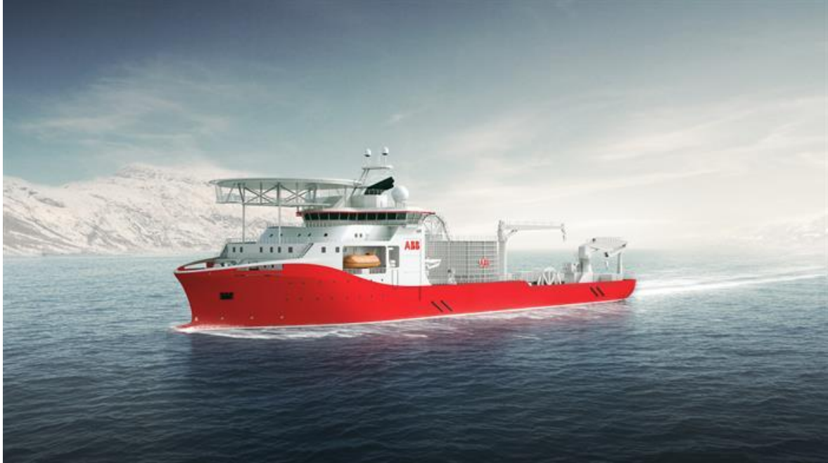
ABB Cable lay Vessel "Victoria"